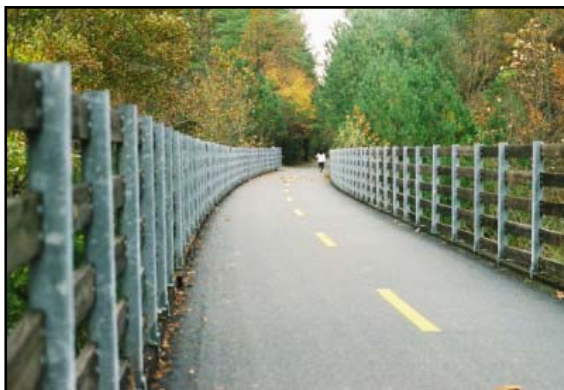
Multi-use bridge in Atlanta

Cost-effectiveness is a priority for most reviewers. Bike and pedestrian projects are generally less expensive than other projects, which helps makes them more cost effective. Bike/Ped coordinators who have used CMAQ funds say bike/ped projects give you a lot of bang for your buck, even if the emissions reductions are not a large as other types of projects. "You could spend your whole budget on a few miles of HOV lanes," one planner said, or you could complete a number of different bicycle and pedestrian projects.