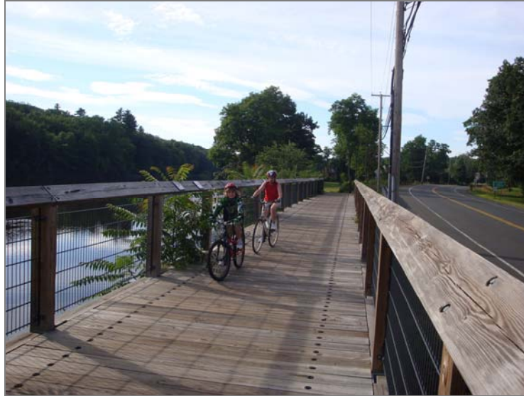
Boardwalk in Collinsville, CT over the Farmington River.