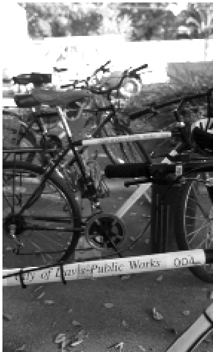
The City of Davis California provides bicycles to their employees for business use. These were unclaimed stolen bicycles