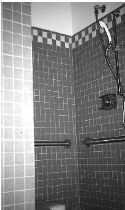
This shower which allows wheelchair access is located in the Florida Department of Environmental Protection as part of the Bicycle/Pedestrian Commuter Center located there.

Ideally, there should be one lockable clothing locker provided for every long term bicycle parking space provided. The regular bicycle/ pedestrian commuter can store work clothes in these lockers to change into. Lockers should be roomy enough to hold a week's worth of clothes. In addition to providing a locker to each regular bicycle/ pedestrian commuter, other lockers should be made available to encourage other employees to try bicycle/pedestrian commuting. These additional lockers will also encourage lunch-time fitness activities which benefit both the employee and the employer.