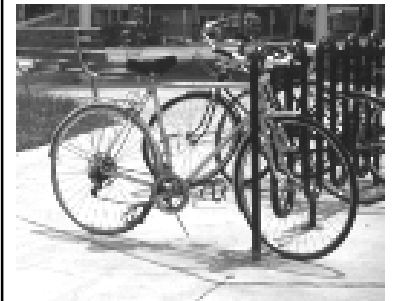
Wave or Ribbon Rack