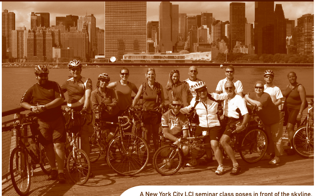
A New York City LCI seminar class poses in front of the skyline.