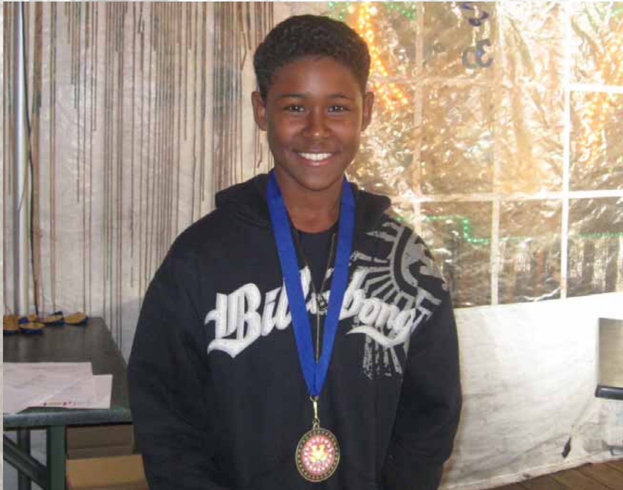
2009 NV YOUTH Series 11/12 Age Group Champion