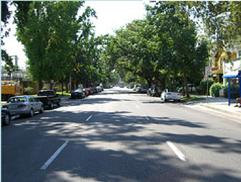
Before: 3-lanes, one-way