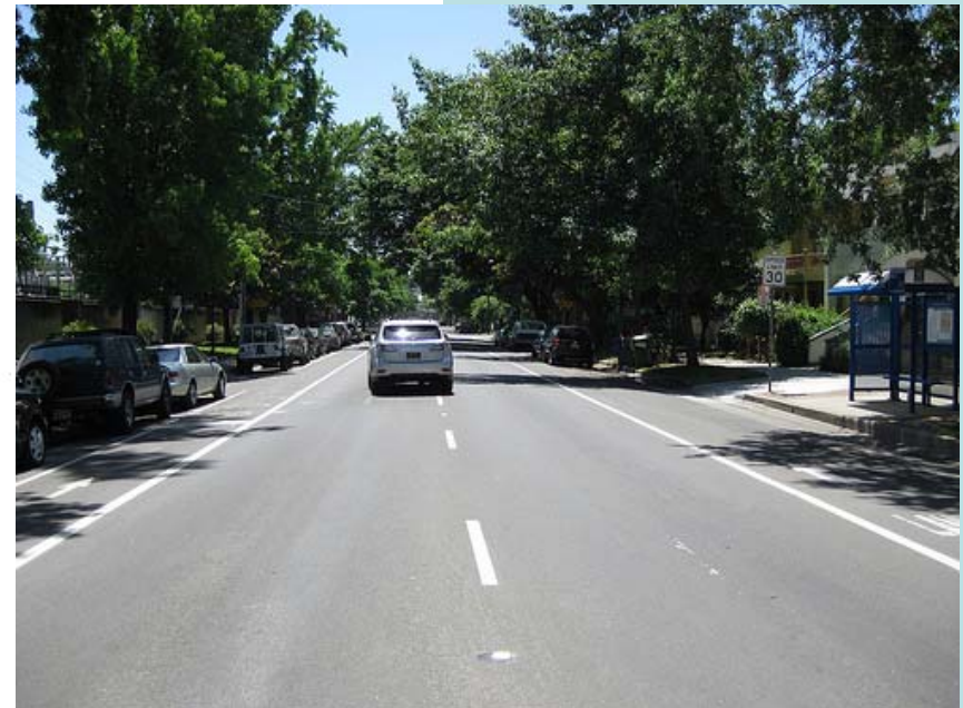
After: 2-lanes, one-way, dual bike lanes