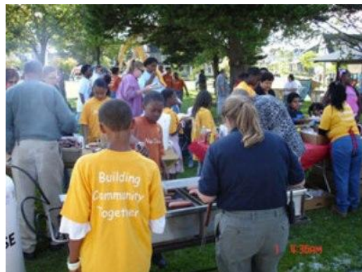
Surveying at National Night Out