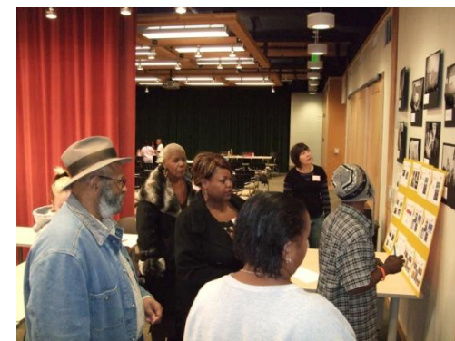
African American Group at New Columbia