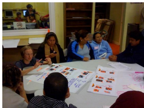
Latino Group at Hacienda