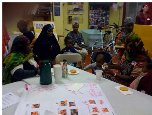
African Group at Hacienda