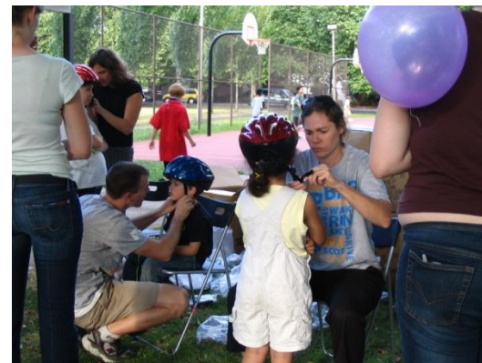
Helmet Incentives at National Night Out